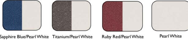
Sapphire Blue/Pearl White Titanium/Pearl White Ruby Red/Pearl White Pearl White